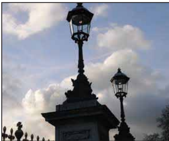
TOP Gas lighting came to Sydney, Australia, in 1841. The picture shows a gas lamp at the corner of Dowling Street and Reid Avenue in the Woolloomooloo district in 1912.