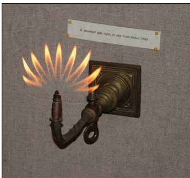
A dovetail burner.

Gas mantles appeared on the scene in 1887 after Carl Auer, a chemist at Bunsen's laboratory in Heidelberg, discovered by accident that asbestos soaked in "rare earth" compounds gave an intense glow when heated by a gas flame.