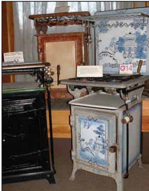
ABOVE Enamelling and the automatic oven thermostat were introduced in the 1920s.

The development of domestic appliances continued with gas water heaters, irons, washing machines and refrigerators.