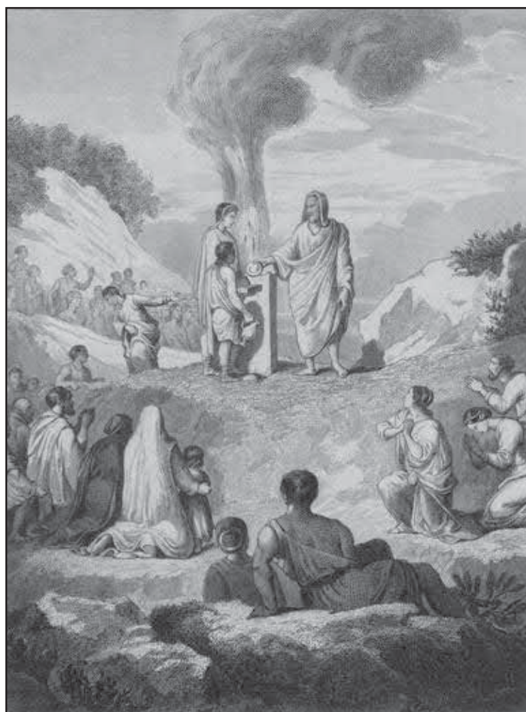
Natural gas provided the fuel for the "eternal fires" of the Zoroastrians.