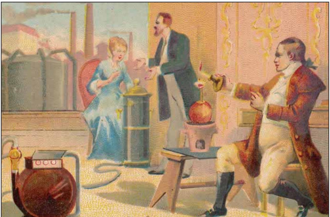
Philippe Lebon worked in Paris on the problems of carbonisation.

Murdoch lit his home in Redruth, Cornwall with gas in 1794, supplying it from a small gasworks in his garden. It was the first practical system of gas