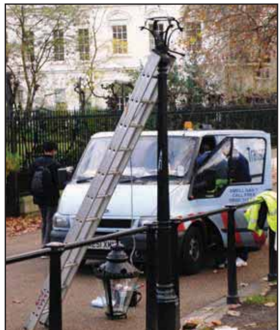
ABOVE AND RIGHT London was the first city to be lit by gas and still boasts gas lighting in certain heritage areas.